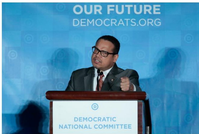
Democratic National Chair candidate, Keith Ellison, addresses the audience as the Democratic National Committee holds an election to choose their next chairperson at their winter meeting in Atlanta, Georgia. February 25, 2017.

Ellison, like the black nationalists he has since distanced himself from, has a history of spewing anti-Semitic conspiracy theories. During a 2010 speech to a mostly Muslim audience, Ellison claimed that America’s foreign policy puts Israel’s interests first because American Jews have been “mobilized” to “do its bidding in America.”