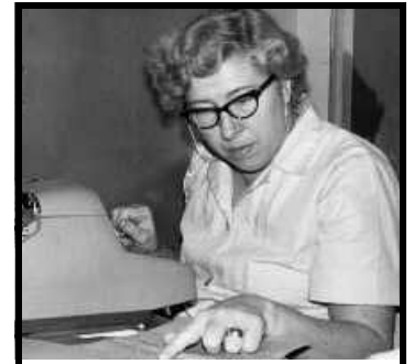
Madalyn Murray O'Hair Born - 1919 Founded American Atheists Murdered by member - 1995

enacting any would-be law violating the First Amendment's command to secure Religious Freedom , it is continually reported by the news media that a Nativity scene or a Ten Commandment display has been ordered by some court to be removed from public property. From the year 1635 to 1963, all public schools opened class with a prayer and Bible reading. Yet without any Constitutional amendment, in the case of Murray v. Curlewett — a suit brought by avowed atheist Madalyn Murray O'Hair on behalf of her son, to end all prayer and Bible reading in public schools — the Supreme Court ruled that there was a separation of Church and State .